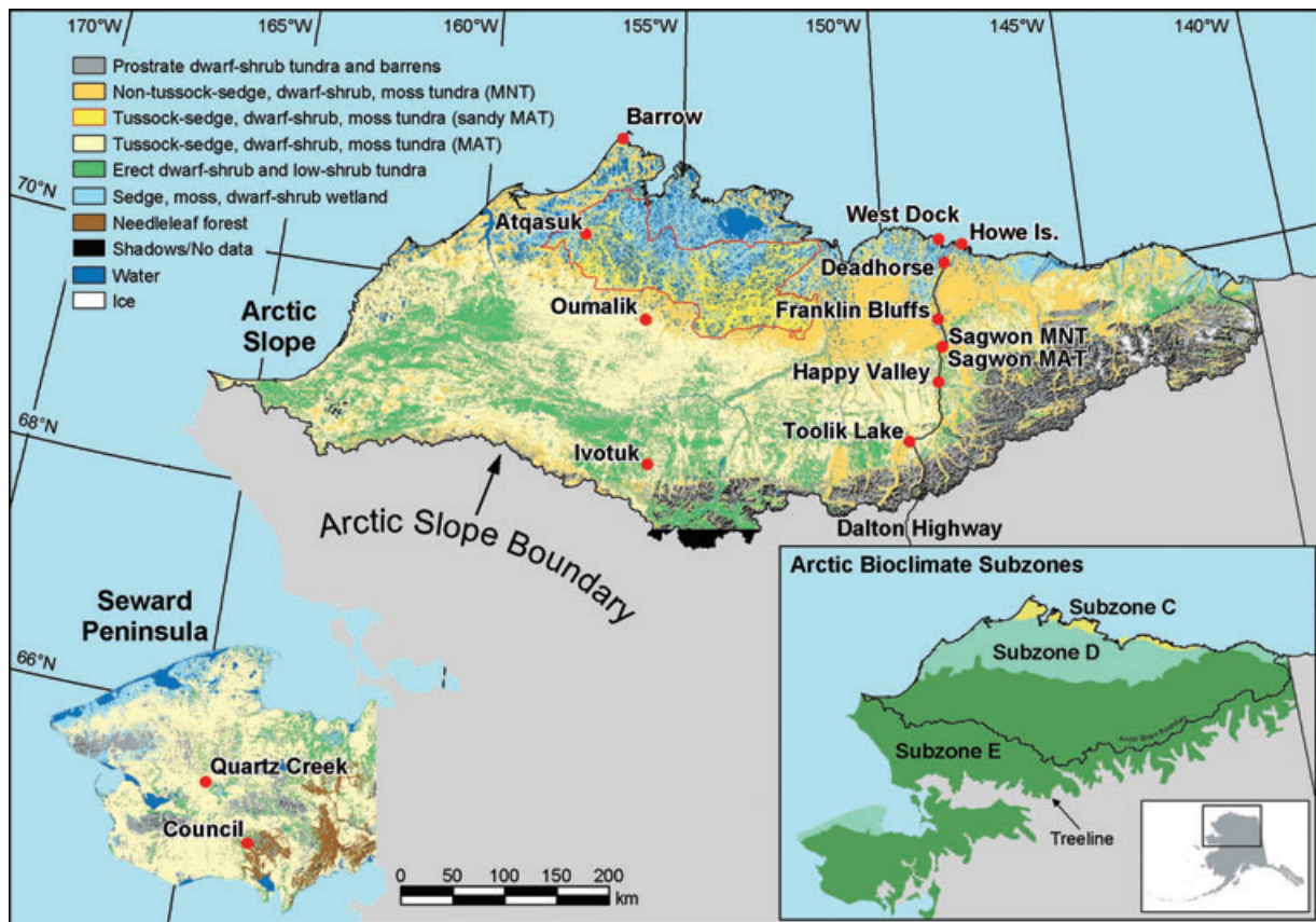
Figure 1 Subzones and transitions of northern Alaska, including important LAII Arctic Transitions of the Land–Atmosphere System (ATLAS) sites. Modified from Walker et al. (2003b).

The transitions between the ecosystems found along this gradient are potentially controlled by many factors, including climate, soil substrate changes, topography, and disturbance and may be expressed as either gradual or abrupt spatial changes. Ecosystem properties can differ dramatically from one side of a transition to the other. We focus on spatial transitions, because these often receive less attention in gradient studies than the larger areas of relatively homogeneous properties. More importantly, transitions are places where ecosystems can change dramatically in response to dynamics of some environmental factor, such as climate (e.g. Neilson, 1993; Noble, 1993; Paruelo et al. , 1999; Scanlon et al. , 2002). In certain cases these transitions reflect abrupt changes with underlying ecological controls, but in other cases they may indicate thresholds in ecological response that reflect the sensitivity of the system to environmental change. An improved understanding of factors controlling spatial transitions may therefore provide insight into ways that a changing environment might trigger vegetation and ecosystem change. These may also be the locations where ecosystem responses to a gradually changing environment are first detected.