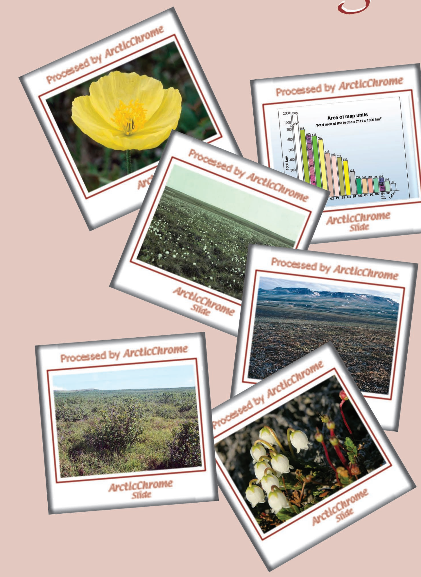
Photo and Image Library

The Photo and Image Library includes photographs of map units and plant species.