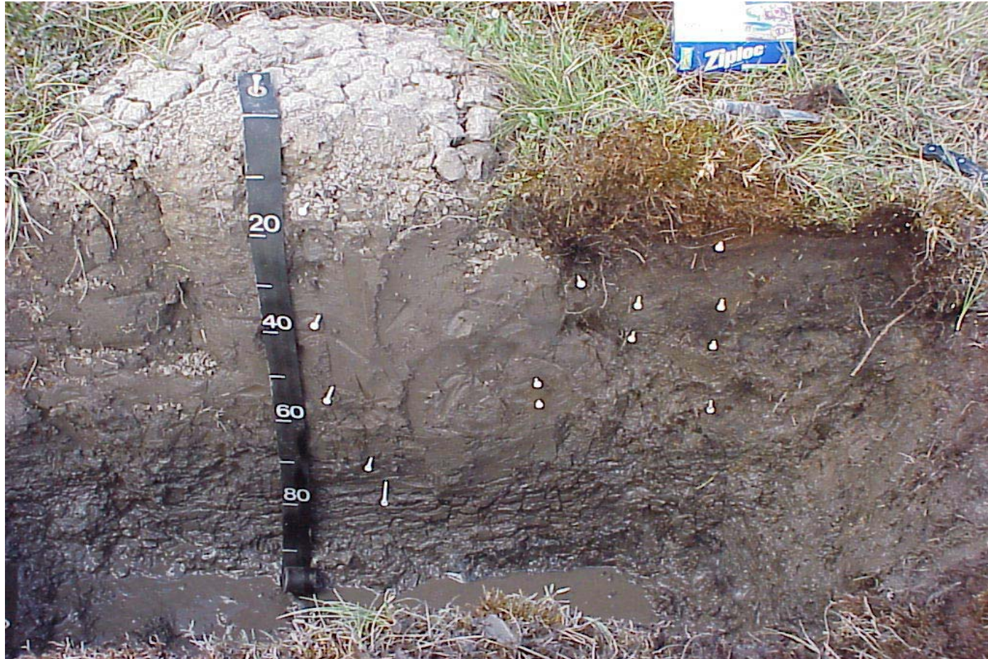
Figure 2. Soils associated with Frost Boils, Galbraith Lake